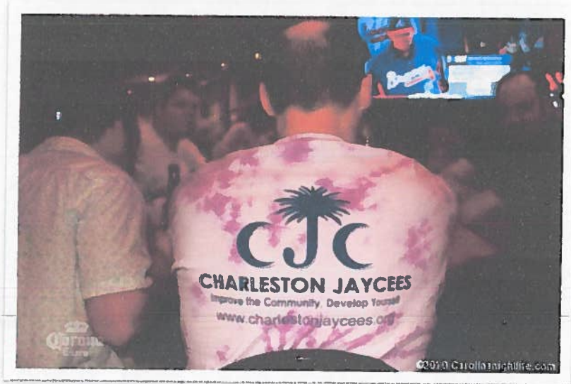
Charleston Jaycee Members showing off their Tie Dyed for a Cure t-shirts at Crawl for a Cure.